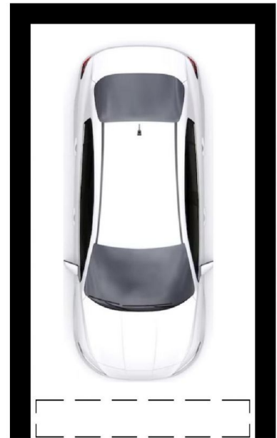
Garage 5.5 x 3.0