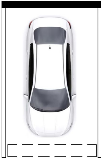
Garage 4.0 x 6.0m