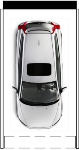
Garage 2.8 x 5.6m