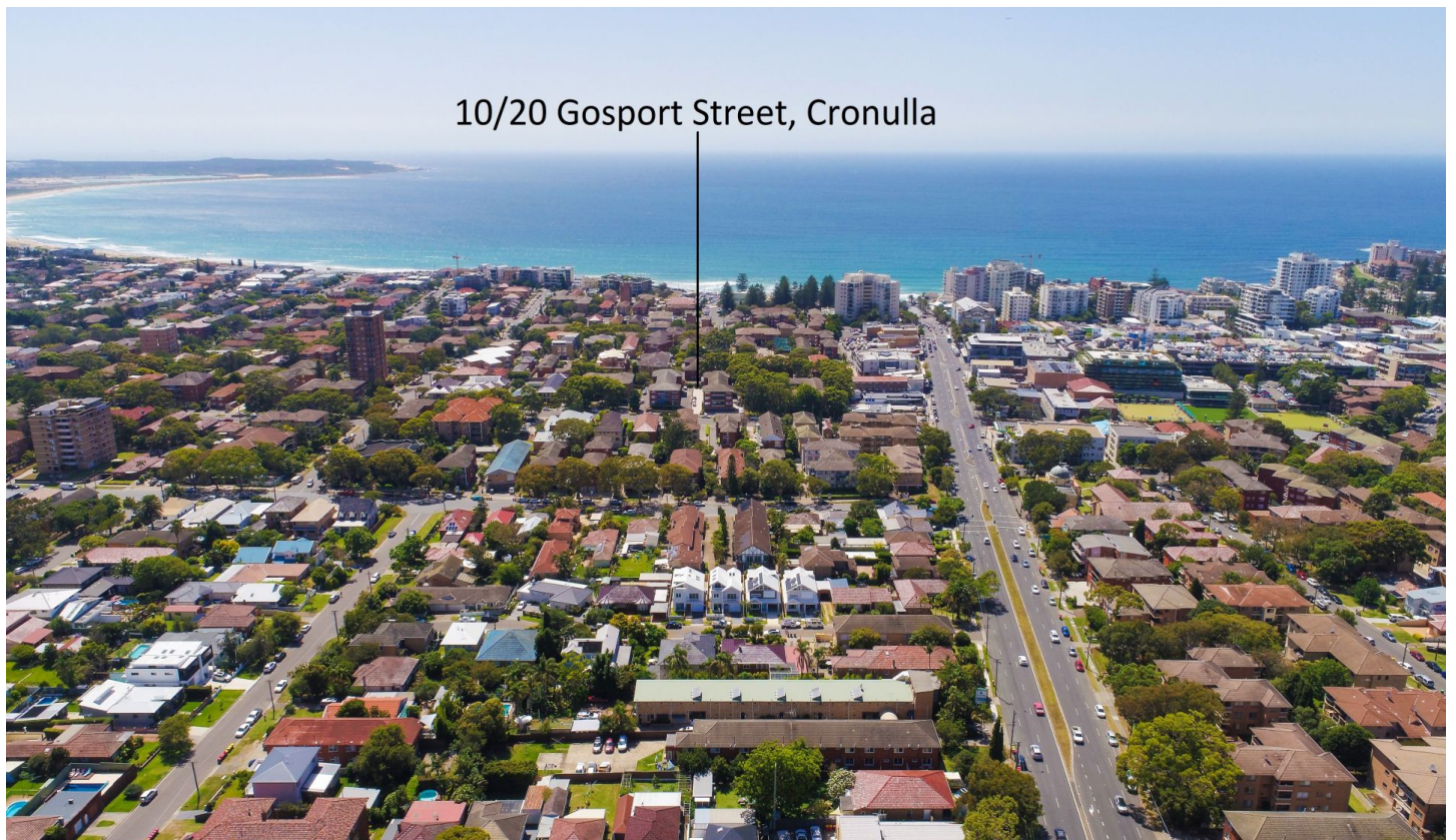
10/20 Gosport Street, Cronulla