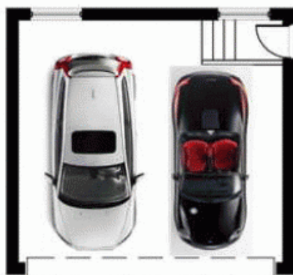
Garage 6.0 x 5.5m