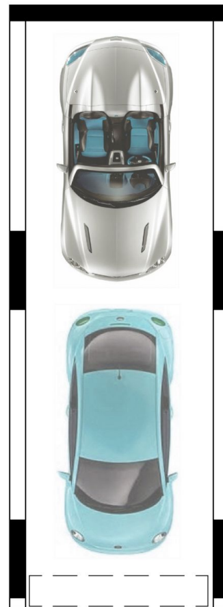
Tandem Garage 3.0 x 9.2m