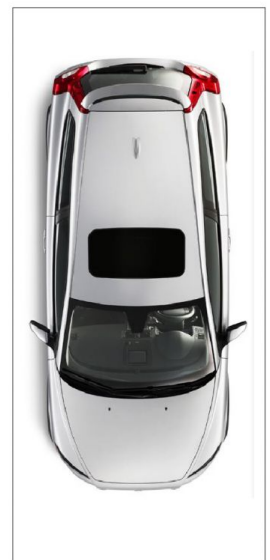
Single Car Space