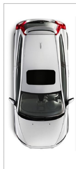
Single Car Space