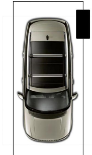
Car Space 2.5 x 5.5m