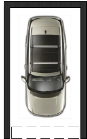
Garage 3.0 x 5.5m