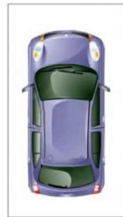
Garaged Car Space