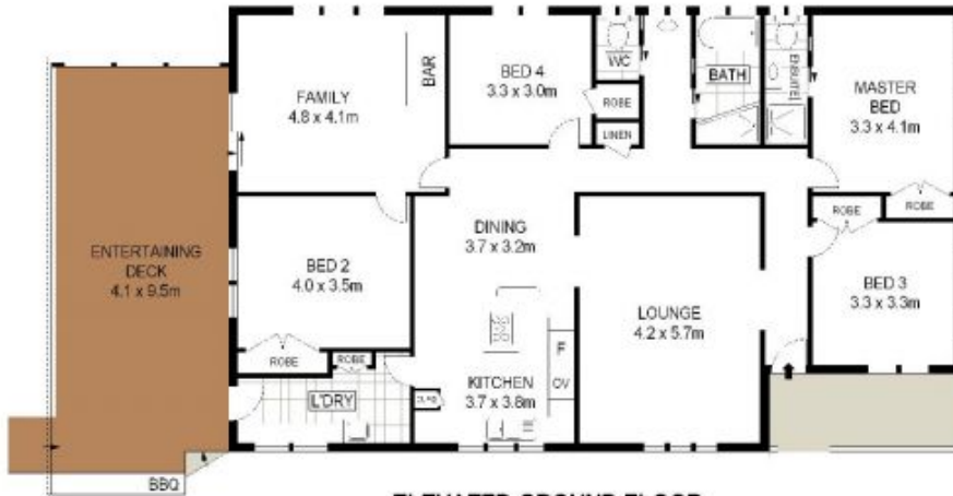
ELEVATED GROUND FLOOR