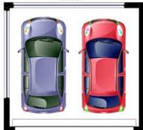
Double Garage (located directly above Bed 5) 6.0x5.5m