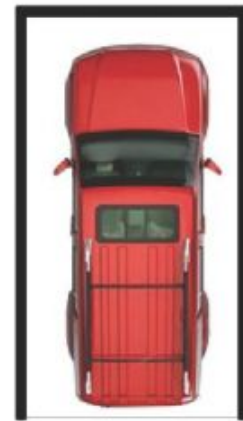
Garage 14 sqm