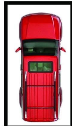
Garage 14 sqm